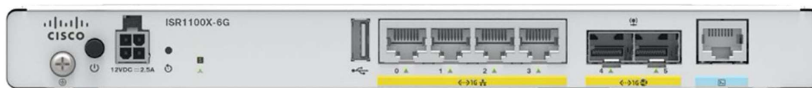
Figure 5. ISR 1100X-6G, front view; back view same as ISR 1100-4G above