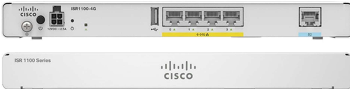
Figure 1. ISR 1100-4G, front and back view

The ISR 1100 Series and ISR 1100X Series routers are delivered as platforms that sit at the perimeter of a site, such as a remote office, branch office, campus, or data center. They participate in establishing a secure virtual overlay network over a mix of any WAN transports.