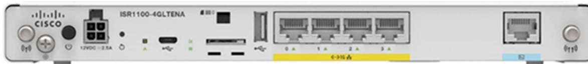
Figure 3. ISR 1100-4GLTE, front view; back view same as ISR 1100-4G above