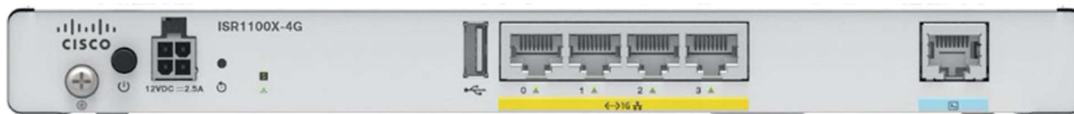
Figure 4. ISR 1100X-4G, front view; back view same as ISR 1100-4G