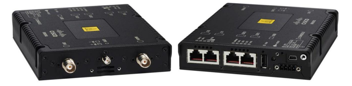
Figure 1. Cisco 809 Industrial Integrated Services Routers with 4G LTE

The IR809 also extends connectivity to include low-power wide-area (LPWA) access using the Cisco Interface Module for LoRaWAN.